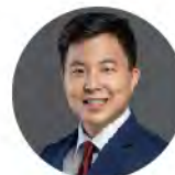
Lee Shih Lim Chee Wee Partnership