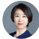
Fang Zhao Hui Zhong Law Firm